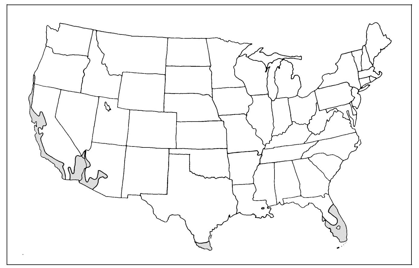
Figure 2. Shaded area represents potential planting range.