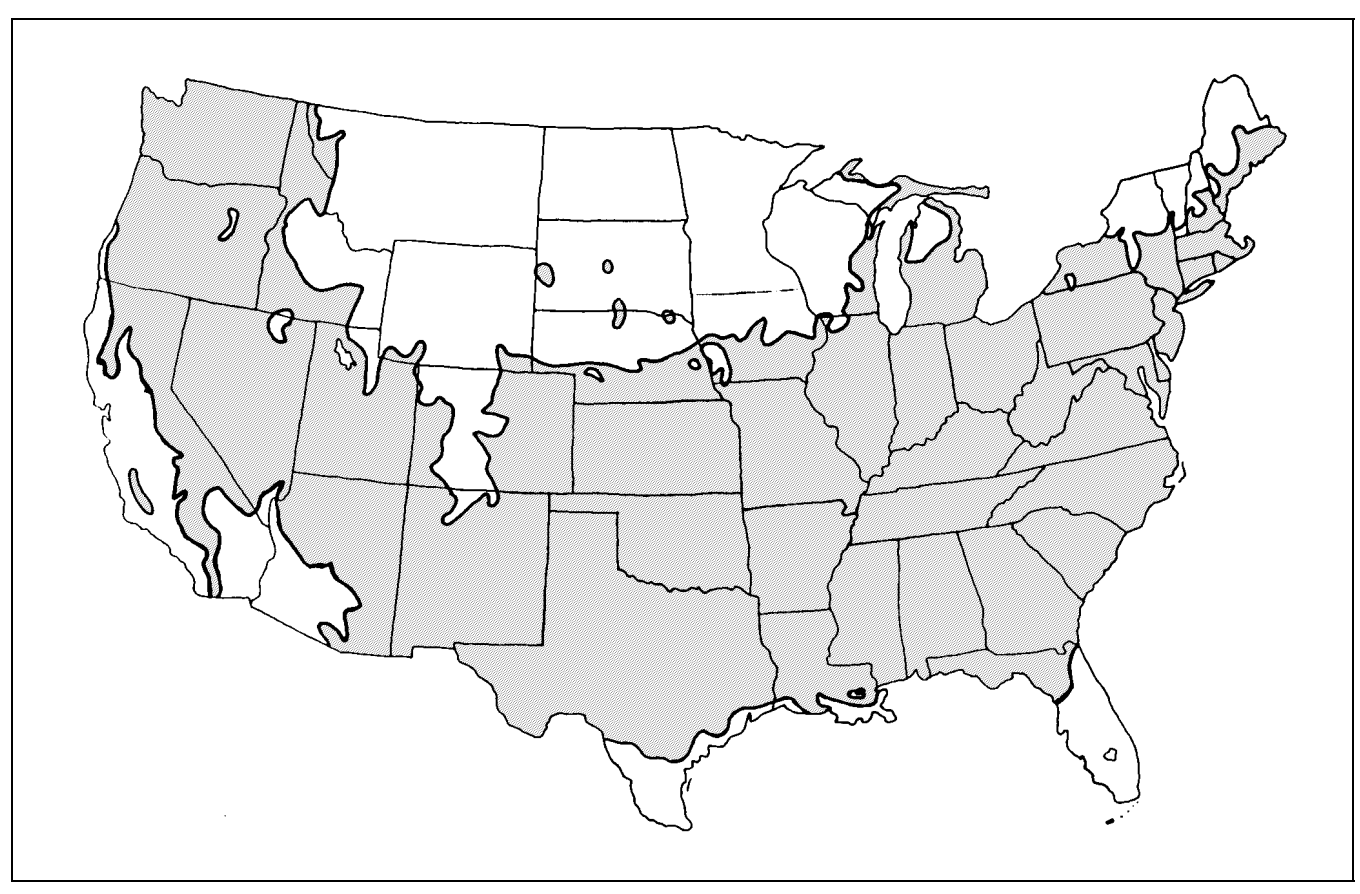
Figure 2. Shaded area represents potential planting range.