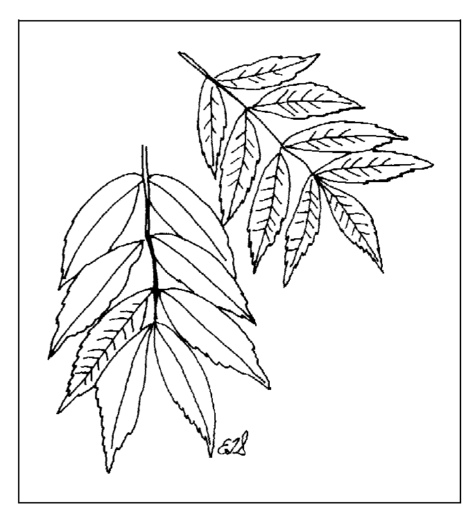
Figure 3. Foliage of Common Ash.

Drought tolerance: high Aerosol salt tolerance: high Soil salt tolerance: good