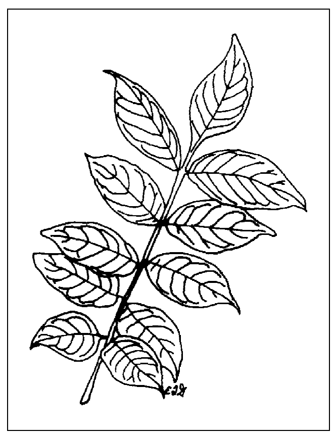
Figure 3. Foliage of Korean Evodia.