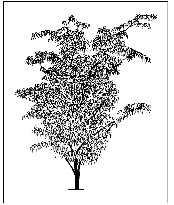
Figure 1. Young 'Milky Way' Kousa Dogwood.

Scientific name: Cornus kousa 'Milky Way' Pronunciation: KOR-nus KOO-suh Common name(s): 'Milky Way' Kousa Dogwood, 'Milky Way' Chinese Dogwood, 'Milky Way' Japanese Dogwood Family: Cornaceae USDA hardiness zones: 5B through 8 (Fig. 2) Origin: not native to North America Uses: container or above-ground planter; near a deck or patio; screen; specimen Availability: somewhat available, may have to go out of the region to find the tree