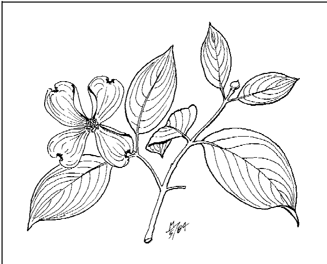
Figure 3. Foliage of 'Cherokee Chief' Flowering Dogwood.