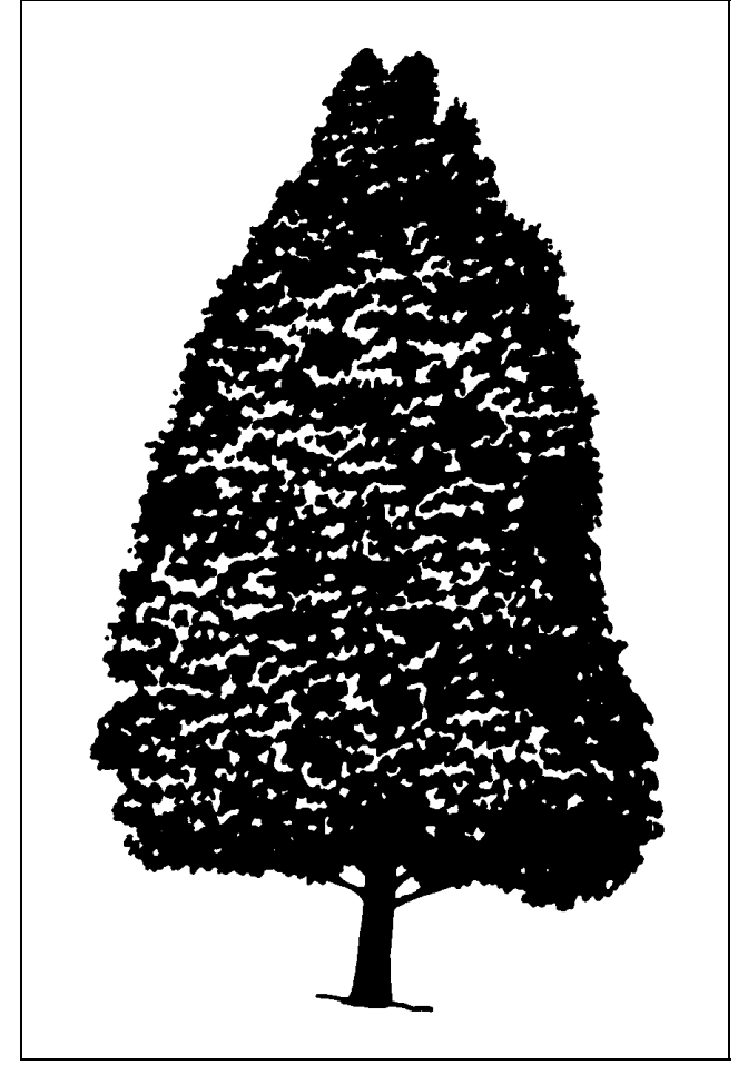
Figure 1. Middle-aged Turkish Filbert.

Uses: large parking lot islands (> 200 square feet in size); wide tree lawns (>6 feet wide); medium-sized parking lot islands (100-200 square feet in size);