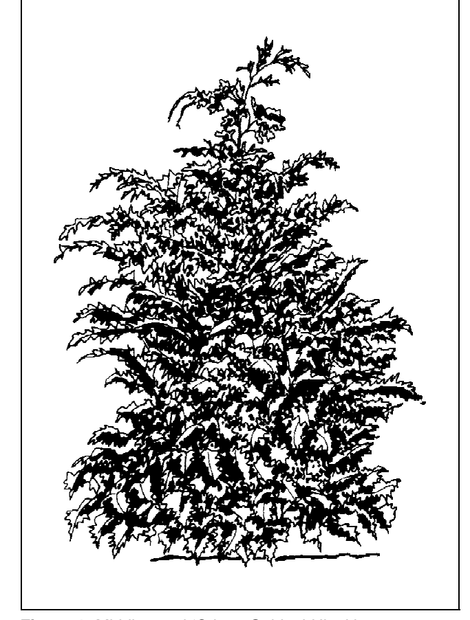
Figure 1. Middle-aged 'Cripps Golden' Hinoki Falsecypress.

Crown density: dense Growth rate: medium