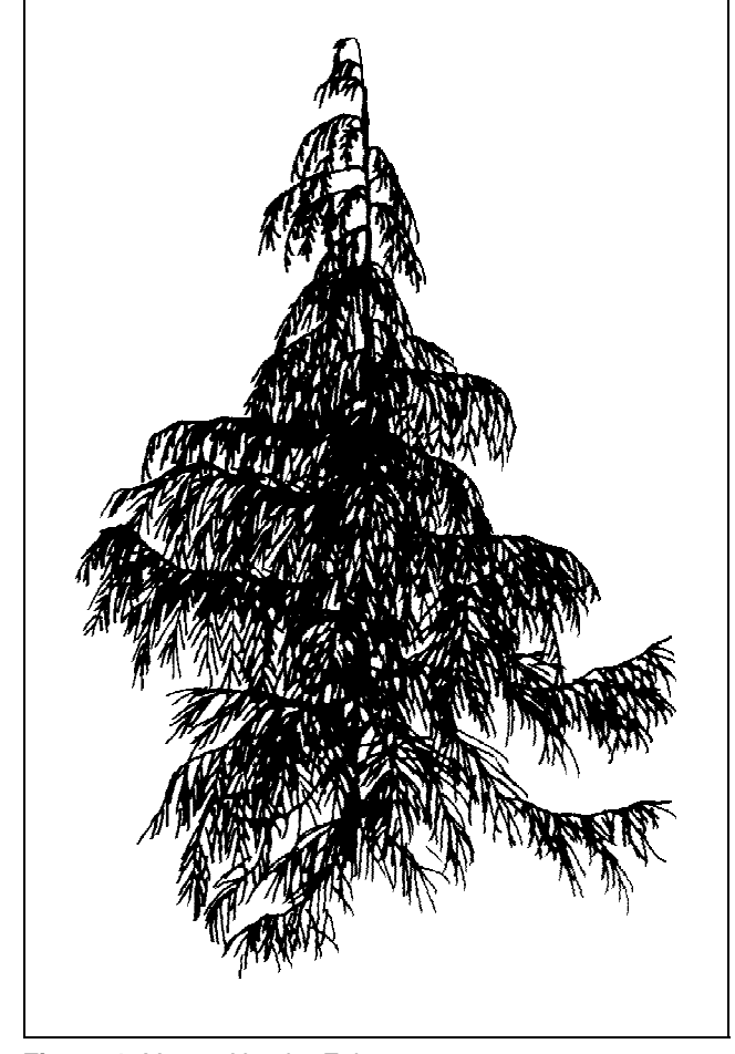
Figure 1. Young Nootka Falsecypress.