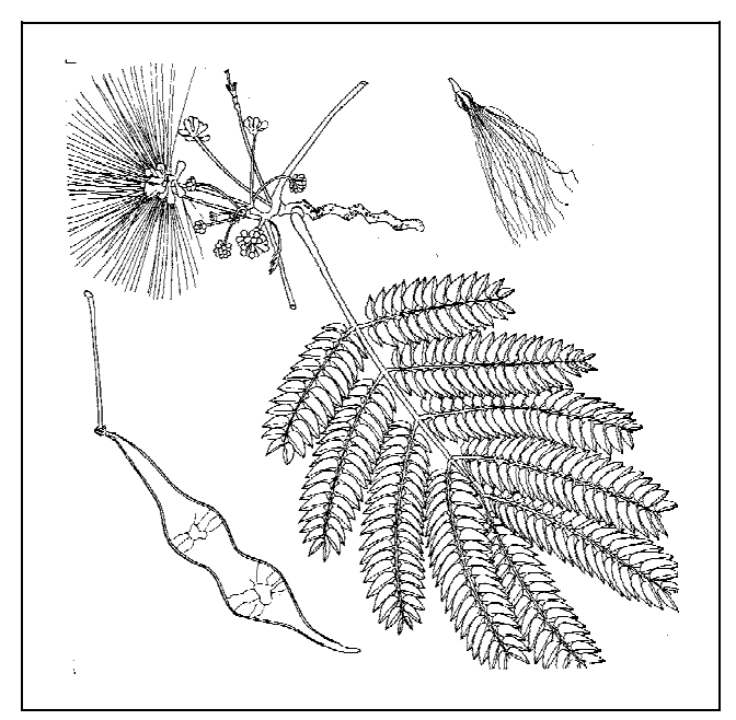
Figure 3. Foliage of Mimosa.

Pest resistance: very sensitive to one or more pests or diseases which can affect tree health or aesthetics