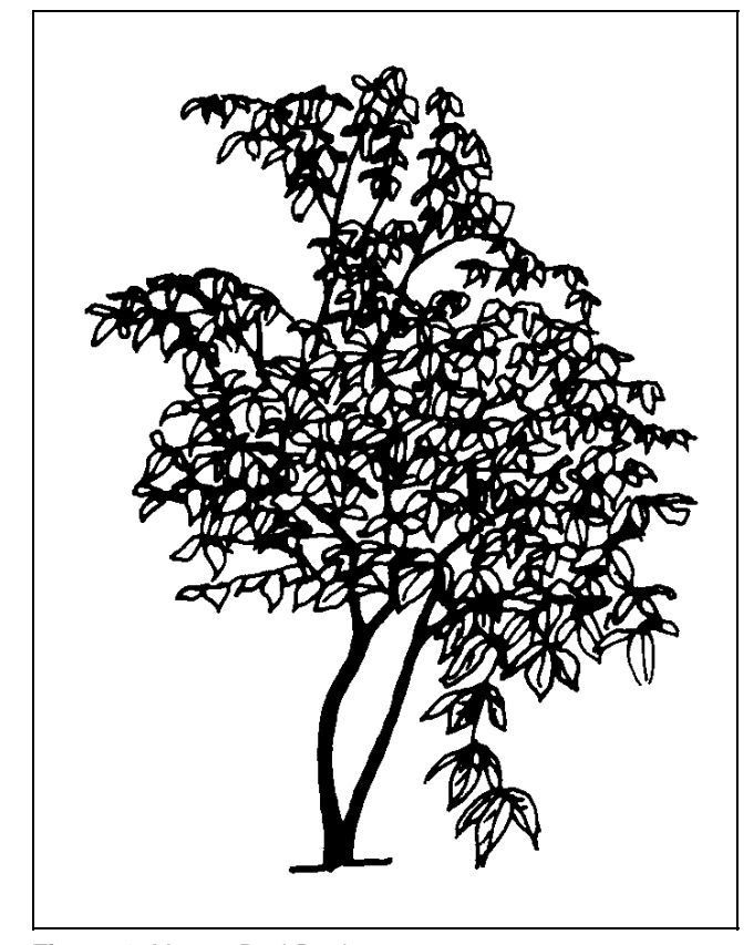
Figure 1. Young Red Buckeye.