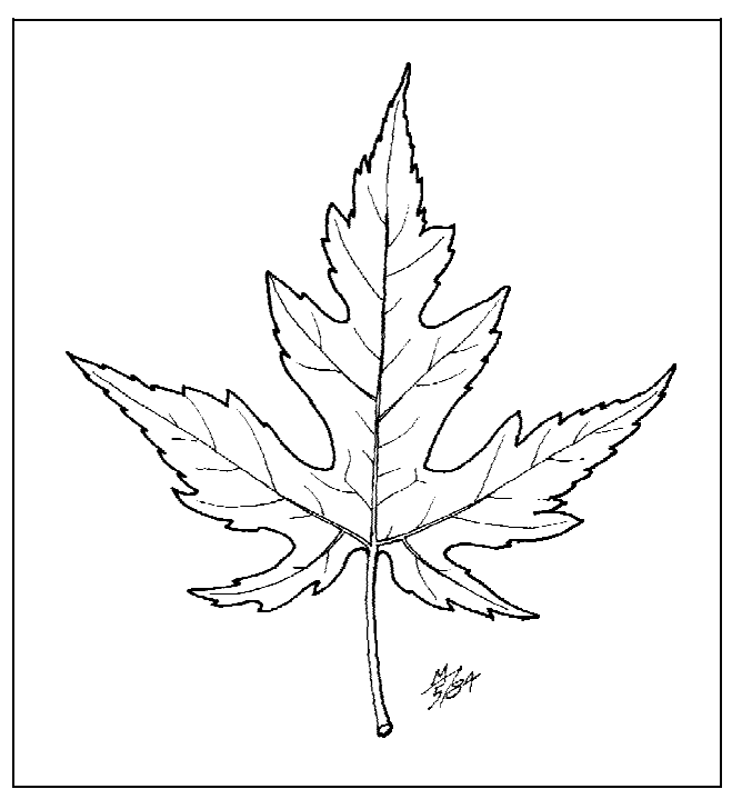
Figure 3. Foliage of 'Pyramidale' Silver Maple.