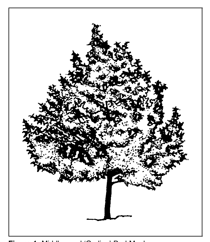
Figure 1. Middle-aged 'Gerling' Red Maple.

Availability: grown in small quantities by a small number of nurseries