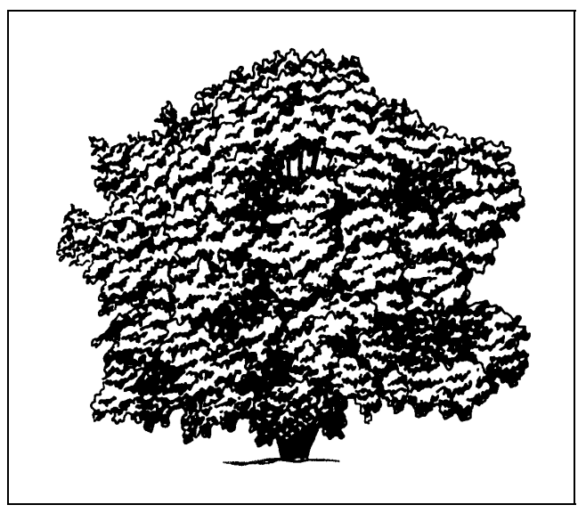
Figure 1. Mature 'Postelense' Hedge Maple.

Origin: not native to North America Uses: Bonsai; hedge; large parking lot islands (> 200 square feet in size); wide tree lawns (>6 feet wide); medium-sized parking lot islands (100-200 square feet in size); medium-sized tree lawns (4-6 feet wide); recommended for buffer strips around parking lots or for median strip plantings in the highway; near a deck or patio; screen; trainable as a standard; shade tree; small parking lot islands (< 100 square feet in size);