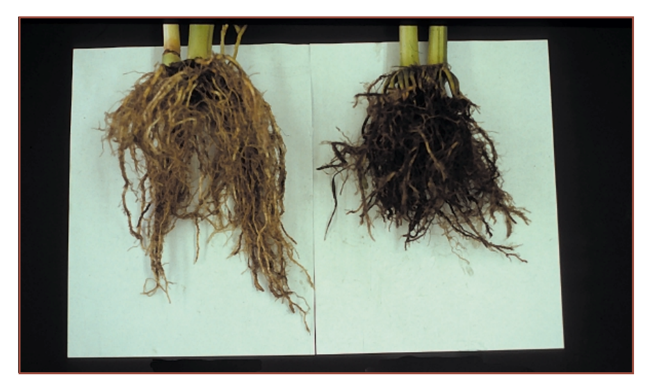
Figure 5. Healthy (left) versus diseased (right) root systems at harvest.