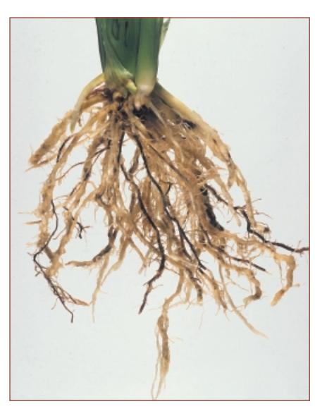
Figure 4. Root system of a plant at the tenth leaf stage. Note that entire roots are blackened with disease.