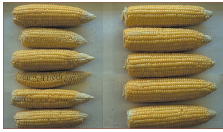
Figure 7. Small ear size, poor fill of ear tips, and dimpled kernels of ears are additional secondary symptoms of root rot. Ears on the left are from diseased plants; healthy ears are on the right.

Generally, root rot is best suppressed with the manipulation of cultural practices. For example, choice of herbicide can influence the severity of root rot. In greenhouse trials, the soil-applied preemergent herbicides Dual and Eradicane increased severity of root rot at the sixth leaf stage. Other soil-applied herbicides (atrazine and Dual II) neither increased nor reduced the severity of root rot.