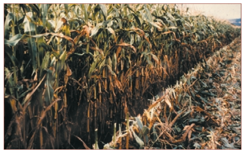
Figure 6. Leaf firing is a secondary symptom of root rot. It starts at the plant base and progresses upward. It usually appears after silking.

Soil fumigation (67 percent methyl bromide, 33 percent chloropicrin at 400 lb/acre or metam sodium at 75 gal/acre) can effectively reduce the severity of root rot and increase yield. However, these chemicals are not regarded as economical.