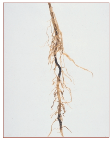
Figure 3. Necrotic lesions developing on the radicle. Lesions expand until roots are completely rotted.

Environmental conditions such as soil moisture and ambient air temperature influence the development of the disease on both the radicle and nodal roots as well as the extent of secondary symptoms.