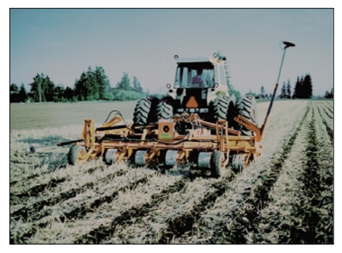
Figure 5.—A Northwest Tillers strip rototiller was used in the 1997–1998 on-farm research trials in the Willamette Valley.