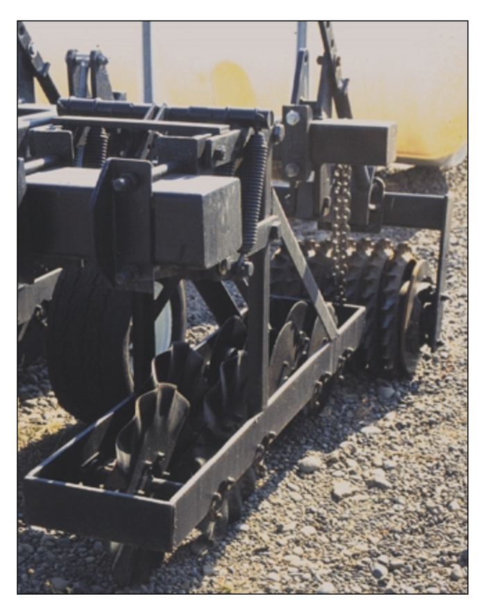
Figure 9.—One approach to second-pass equipment for strip-till is this machine, which uses a series of flat disks followed by a ring roller (designed by J. Hendricks and R. Heater).