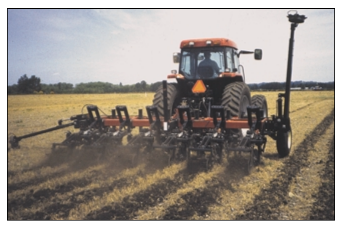
Figure 7.—The Unverferth Ripper-Stripper strip-till machine is similar to the Transtiller, using a subsoiling shank and pairs of fluted coulters to prepare a seedbed.