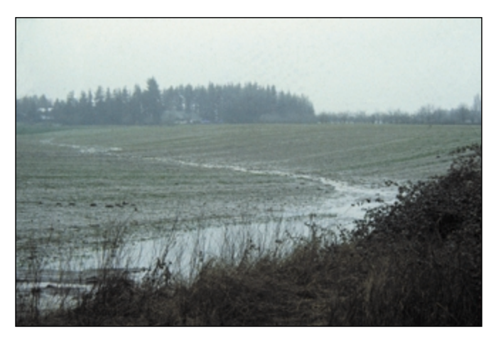
Figure 3.—Water runoff from fields during rainstorms can carry dissolved and suspended nutrients into surface water.