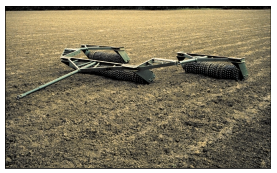
Figure 11.—A ring roller, or cultipacker, is a useful finishing implement in strip tillage. The rollers crush soil clods and smooth the soil surface.

Strip tillage generally has been less productive in highly compacted soils. In fields with known or sus-