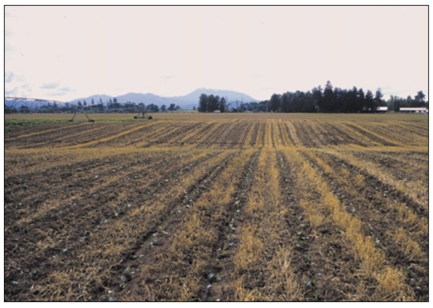
Figure 15.—Strip tillage has been adopted for production of sweet corn, squash, and transplanted broccoli (shown here).