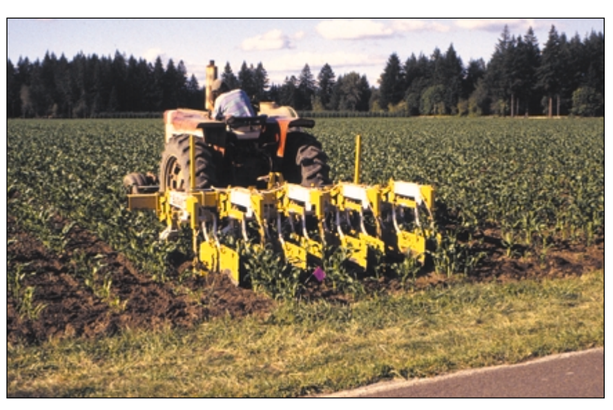
Figure 13.—Cultivation between rows is possible in strip-till systems using conventional cultivation equipment. The Buffalo cultivator (shown here) is designed to operate in high-residue conditions.

However, making the transition to strip tillage represents a major systems change. There is a learning curve to be mastered before success is achieved. If you are considering