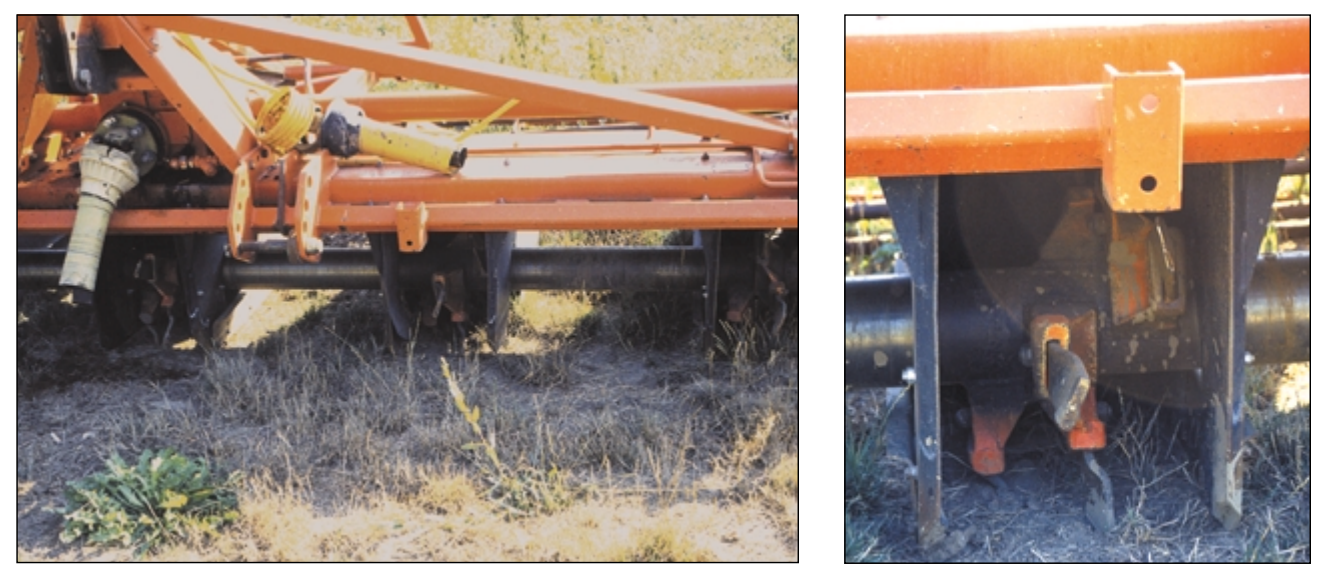
Figure 10.—The Howard Rotospike tiller shown here has been modified with soil shields for use in second-pass operations in strip-till systems. The closeup view on the right shows the heavy-duty spikes, which are used instead of traditional L-shaped tines.