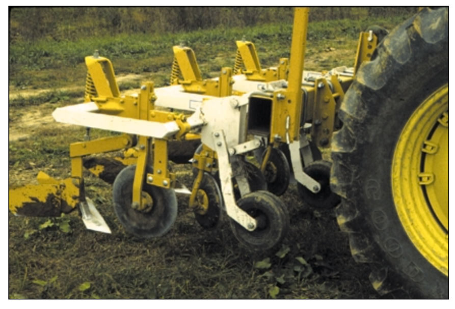
Figure 14.—Components of the Buffalo cultivator that allow it to operate in high-residue conditions include a rolling disk coulter to cut through residue in front of the heavy-duty sweep cultivators.