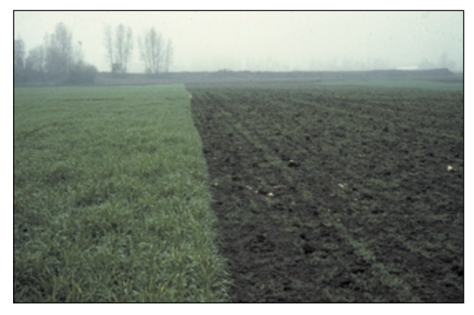
Figure 4.—Cover crops can provide soil cover, reduce erosion, and enhance both soil quality and productivity.

harvesting equipment was used. Sweet corn grade was determined by the cooperating food processing company.