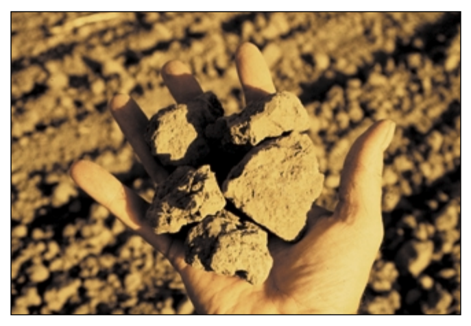
Figure 2.—Clods formed during the tillage process reduce soil quality during key times of seedling emergence and crop root development.