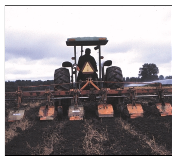
Figure 8.—A light-duty rotary cultivator can be used for a second-pass tillage pass in strip-till systems to improve seedbed quality.

By understanding the field conditions that favor strip tillage (and those that are unfavorable), you can apply cultural practices that improve the probability of success. You also might decide to use conventional tillage where strip tillage is inappropriate.