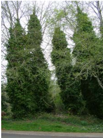
Figure 1.—Ivy can kill large overstory trees.

Ivy is an evergreen vine with thick, waxy leaves and distinct immature and mature growth stages. The immature, vegetative stage grows rapidly both along the ground or climbing, in shade or sun. Its leaves are dark green, with three to five