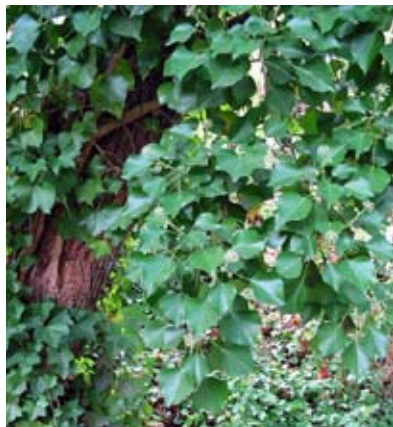
Figure 2.—Ivy in flower.

lobes that often have white veins. The mature, fruiting stage grows in open sun and has heart-shaped, unlobed leaves on upright stems bearing umbrellalike clusters of greenish white flowers in fall (Figure 2). Dark purple to black, berrylike fruits, with one to three stonelike seeds, develop in spring. Ivy reproduces from rootlike stems, sprouting fragments, or seeds. Seeds are spread by birds. The bird's digestive tract helps scarify seeds, which improves germination. Ivy grows in a wide variety of soils, and it tolerates drought, frost, and deep shade.