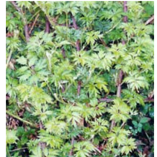
Figure 2.—Evergreen blackberry.

surface and bear only leaves. Second-year canes arise from first-year canes and bear both leaves and flowers. Himalayan blackberry resprouts vigorously from rhizomes and root crowns (Figure 3). Canes also can root at the tips and nodes.