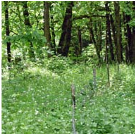
Figure 1.—Garlic mustard in forested understory.

dominates forested understories (Figure 1). It has no known natural enemies in North America and is difficult to eradicate once established. Garlic mustard appears to alter habitat for native birds, mammals, and amphibians and may affect their populations and diversity. Once introduced, it outcompetes native plants for moisture, nutrients, and space.