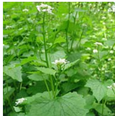
Figure 2 (far left).—Garlic mustard leaves.