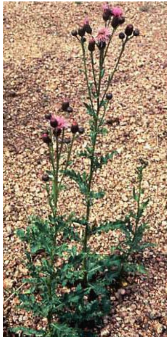
Figure 1.—Mature Canada thistle.

Combining control methods is the best form of Canada thistle management. Persistence is imperative so that the weed is continually stressed, forcing it to exhaust nutrient reserves in its roots and eventually die. Infestations start on disturbed ground including roadsides and logged areas. One plant can colonize an area 3 to 6 feet in diameter in 1 or 2 years.