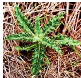
Figure 2 (top).—Canada thistle flowers. Figure 3 (lower).—Canada thistle rosette.

Note: Before you apply herbicide on forest land, you must file a "notification of operations" with the Oregon Department of Forestry at least 15 days in advance.