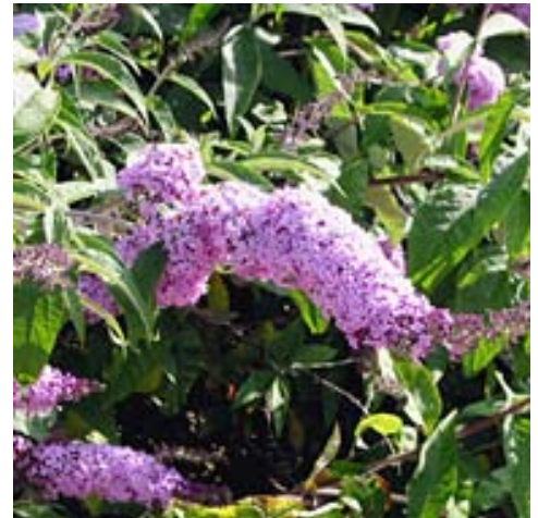
Figure 2.—Butterfly bush has a showy flower head.

blue-gray on top and white to silvery underneath. Flowers resemble a lilac's: fragrant, showy, and purple (Figure 2).