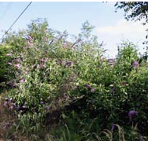
Figures 1a–b.—Butterfly bush can be invasive in many different types of habitat.