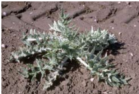
Figure 1.—Bull thistle rosette.

pinkish purple flowers, which appear from July through September, are 1.5 to 2 inches wide and are usually solitary. Seeds are dispersed by the wind and may remain viable in the soil for 10 years.