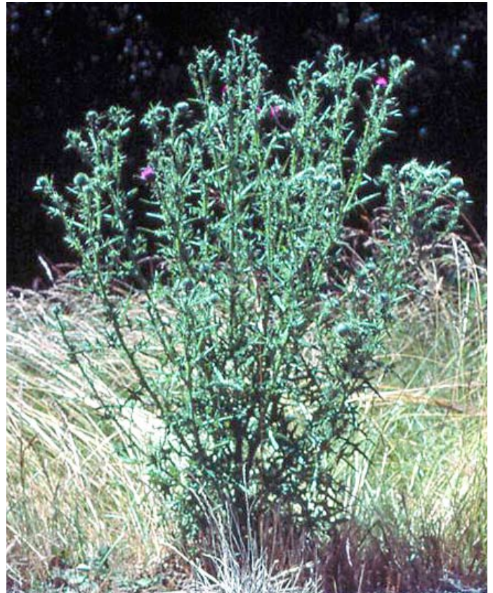
Figure 2.—Second-year (mature) bull thistle.

Note: Before you apply herbicide on forest land, you must file a “notification of operations” with the Oregon Department of Forestry at least 15 days in advance. The following information about herbicides is only a brief