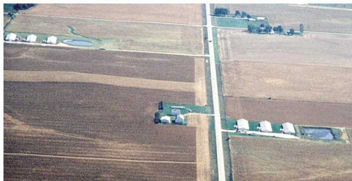
Veterinary pharmaceuticals used in animal agriculture can enter streams through runoff or infiltration. A swine facility near the South Fork Iowa River, Iowa, is shown above.

The most frequently detected chemicals (found in more than half of the streams) were coprostanol (fecal steroid), cholesterol (plant and animal steroid), N-N-diethyltoluamide (insect repellent), caffeine (stimulant), triclosan (antimicrobial disinfectant), tri (2-chloroethyl) phosphate (fire retardant), and 4-nonylphenol (nonionic detergent metabolite). Steroids, nonprescription drugs, and insect repellent were the chemical groups most frequently detected. Detergent metabolites, steroids, and plasticizers generally were measured at the highest concentrations.