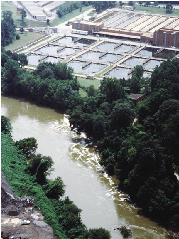
Household chemicals can enter streams through wastewater discharges. A wastewater treatment facility near Atlanta, Georgia, is shown above.

Background: Chemicals, used everyday in homes, industry and agriculture, can enter the environment in wastewater. These chemicals include human and veterinary drugs (including antibiotics), hormones, detergents, disinfectants, plasticizers, fire retardants, insecticides, and antioxidants. To assess whether these chemicals are entering our Nation's streams, the Toxic Substances Hydrology Program of the U.S. Geological Survey (USGS) collected and analyzed water samples from 139 streams