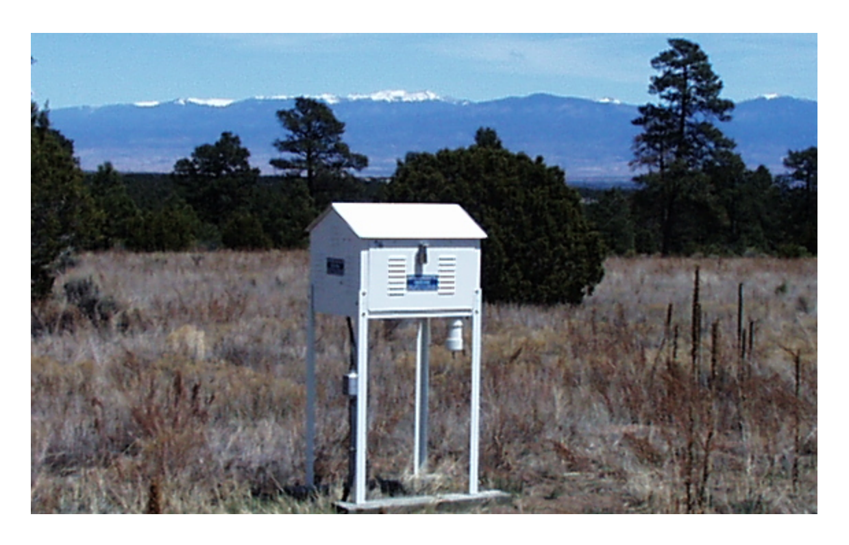
Air Monitoring Station on LANL Property

This report describes the Rad-NESHAP program and compliance activities at LANL and in addition, contains tables of data required for reporting purposes; of these, Table 16 provides doses calculated at various public locations around LANL, and Table 17 summarizes the different LANL contributions to the total highest dose for CY2000.