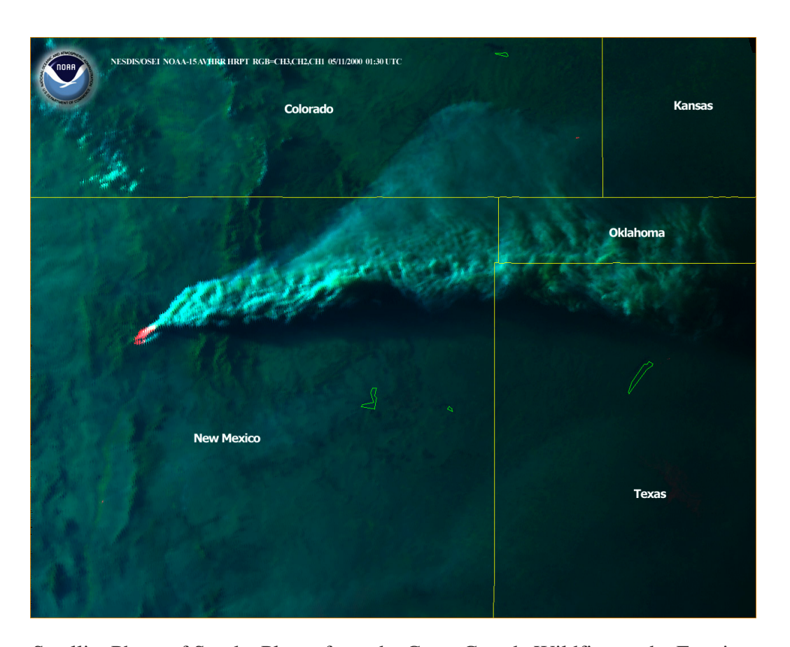
Satellite Photo of Smoke Plume from the Cerro Grande Wildfire on the Evening of May 10, 2000.

Also in 2000, the Air Quality group identified the need for a new air-sampling site for the compliance network; and the need to relocate an existing sampler to meet data quality objectives. Consequently a new sampler was added at the TA-3 Research