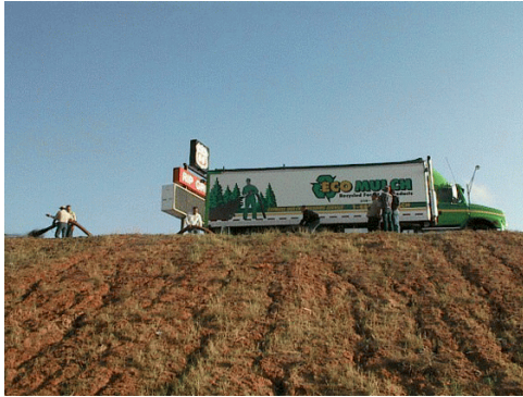
Rills are often obvious on steep or unprotected banks.