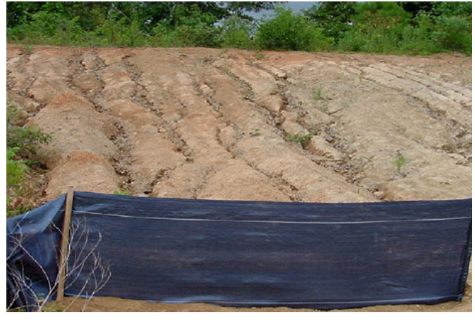
Erosion at construction sites is usually controlled with silt fences.