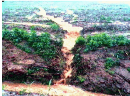
Erosion is especially critical in areas where runoff enters a stream or gully.