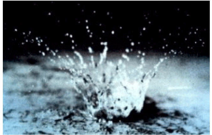
Raindrops hitting a soil surface will detach and erode soil particles.

Sheet erosion is the removal of a fairly uniform