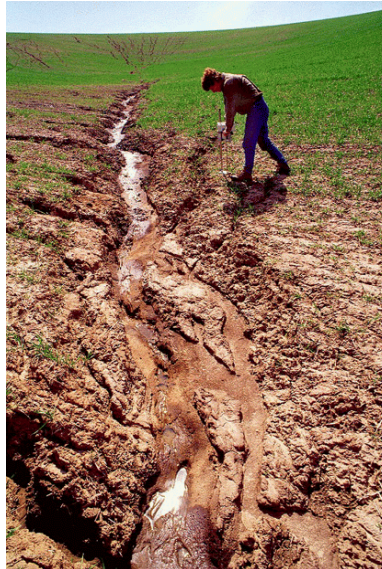
This rill could easily turn into a gully if erosion is not controlled.