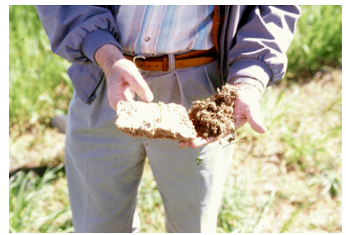
Development of soil crust reduces infiltration, causing more runoff and erosion.