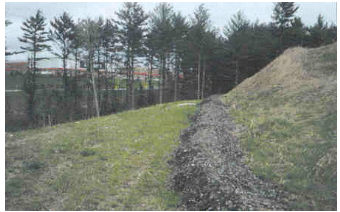
Examples of compost filter berms.

the compost and soil surface. Always apply compost at least 3 feet over the shoulder of the slope or into existing vegetation where possible to prevent rill formation and transport of the compost