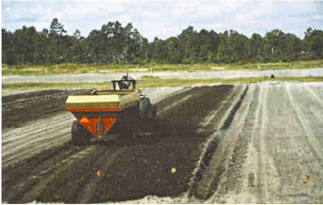
A standard agricultural manure spreader can be used on minor slopes.