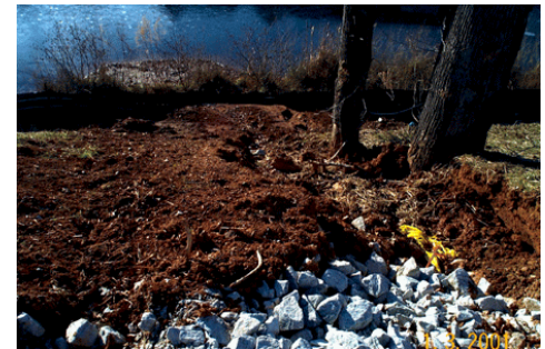
Eroding slopes can lead to sediment build-up in water bodies.