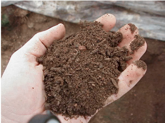
Stable compost serves as an excellent soil builder.

Composting is the controlled biological process of decomposition and recycling of organic material into a humus rich soil amendment known as compost . Mixed organic materials ( Example: manure, yard trimmings, food waste, biosolids) must go through a controlled heat process before they can be used as high quality, biologically stable and mature compost (otherwise it is just mulch, manure or byproduct). Compost has a variety of uses and is known to improve soil quality and productivity as well as prevent and control erosion.