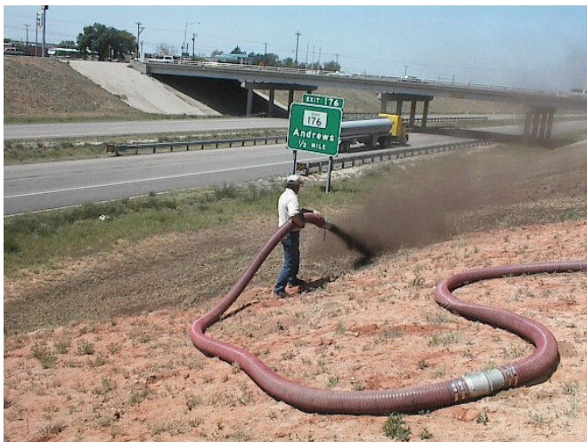
Pneumatic blowers are more appropriate for steeper slopes or smaller areas.

Blankets and mats are easiest to apply using a pneumatic blower (pictured below), especially on slopes where spreaders may not be an option. Finer compost is easier to apply and spreads more evenly using a pneumatic blower. At least 300 feet of hose is recommended when applying compost with this technology. Compost and manure spreaders are effective application devices but only work well on open, gradual slopes. It is best to apply the compost layer on the slope contour or up and down the slope to prevent water from sheeting between