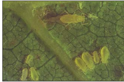
Figure 2. Walnut aphids.

Codling moths rarely are a problem in walnuts in Oregon, but they do occasionally infest a crop. Their white or pink