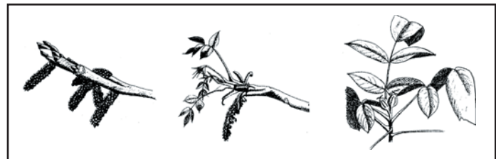
Figure 4. Growth stages for walnut blight spray. Left to right: early prebloom, late prebloom, postbloom. Not shown: June–July, July–August.

Chemical repellents sometimes are partially successful. Bags of dried blood, bone meal, and human hair hung in the trees are the most