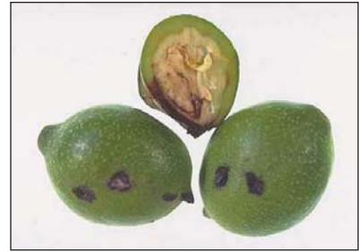
Figure 3. Walnut blight.

Three sprays of copper during the bloom period are