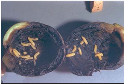
Figure 1. Walnut husk fly adult (top) and larvae (bottom).

and the larvae begin feeding on the husk. It takes 3 to 5 weeks for the larvae to complete their development. The mature larvae tunnel to the outside of the husk and drop to the ground, where they enter the soil and overwinter as pupae. There often is a second peak of emergence 3 weeks following the first. The late-emerging flies can produce larvae that feed in the husk well into October.