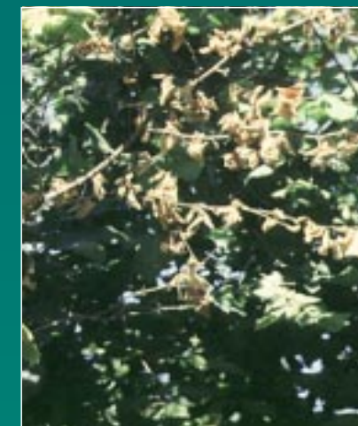
Figure 2.—In summer, it's easy to see dead leaves on infected branches.

Eastern filbert blight may be confused with Eutypella cerviculata , which produces smaller, black, fruiting bodies on dead branches. This fungus produces diagnostic black rings under the bark, which can be detected using a pocket knife. Cicada egg-laying scars also can look somewhat like EFB, but they are not black, and they look stitched.