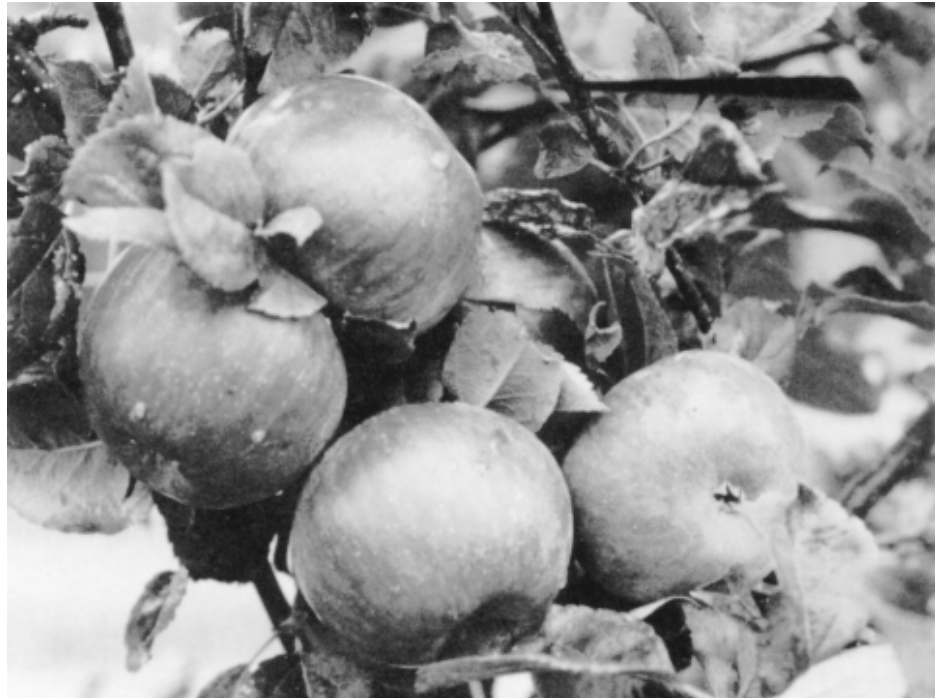
One of the largest scab-immune apples, Freedom has very short stems.

Some of the scab-immune varieties are not resistant to another disease, powdery mildew, caused by the