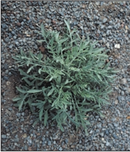
Figure 5.—Spotted knapweed, rosette stage.