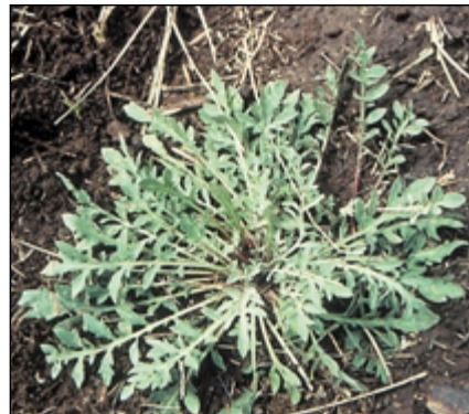
Figure 3.—Diffuse knapweed, rosette stage.

Knapweeds bloom white, pink, purple, or yellow from June through October. See page 3 for descriptions of these weeds. Figures 1–9 show the four species in their rosette and mature stages. Control methods are discussed below.