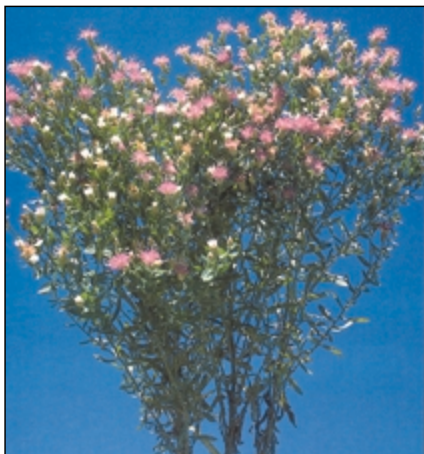
Figure 2.—Russian knapweed, flowering.

( Centaurea solstitialis ). These four species are a serious problem throughout Oregon and the Pacific Northwest. Stands of knapweed can choke out natural vegetation by competing for water and nutrients.