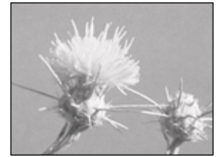
Yellow starthistle Centaurea solstitialis