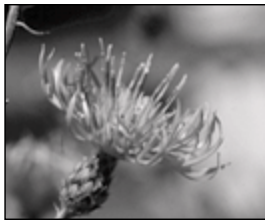
Spotted knapweed Centaurea maculosa