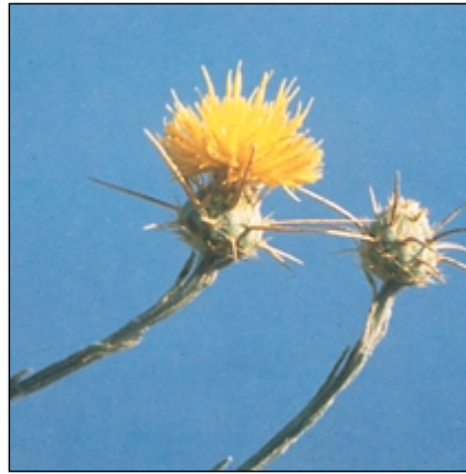
Figure 8.—Yellow starthistle, flowering.