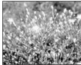
Diffuse knapweed Centaurea diffusa