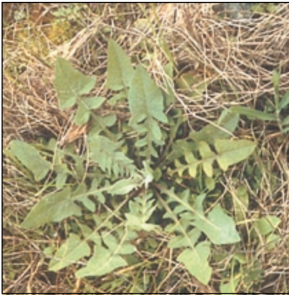
Figure 7.—Yellow starthistle, rosette stage.