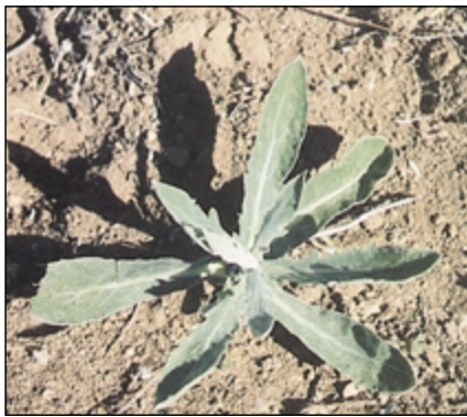
Figure 1.—Russian knapweed, rosette stage.

Four species of Centaurea are commonly found in central and eastern Oregon, including spotted knapweed ( Centaurea maculosa ), diffuse knapweed ( Centaurea diffusa ), Russian knapweed ( Centaurea repens ), and yellow starthistle