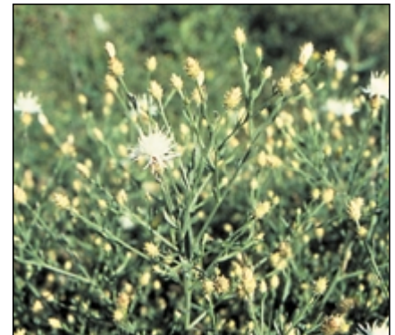
Figure 4.—Diffuse knapweed, flowering.

Timing is important for effective control. Unfortunately, most people do not recognize a knapweed species until it is flowering. By that time, hand