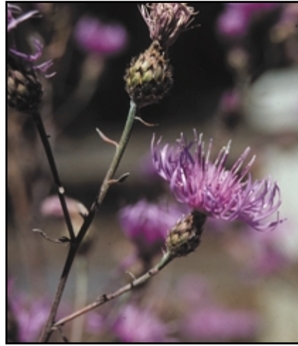
Figure 6.—Spotted knapweed, flowering.