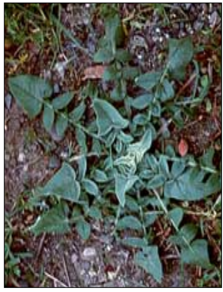
Figure 2.—In full sunlight, yellow starthistle rosettes grow flat against the soil surface; the blue-green leaves are deeply lobed along the sides and have a large, triangular lobe at the tip.

Although the plant cover that works for you may range from a single cultivated grass species to a mixture of native plants, the process of planning and implementing a seeding program is similar in all cases.