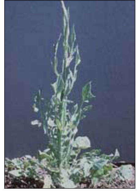
Figure 5.—When yellow starthistle is bolting (developing an upright stem), plants are more easily pulled or damaged by grazing animals.