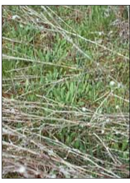
Figure 4.—By late winter, seedlings emerge from beneath the skeletons of the previous year's yellow starthistle plants.