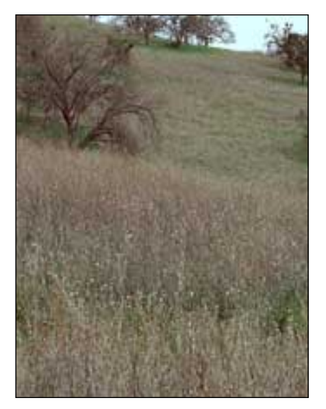
Figure 1.—Where yellow starthistle invades grasslands and open oak woodlands, hillsides appear golden in the summer, but by winter they become an expanse of weathered, gray stems topped with white fuzz.

which plant cover fulfills the objectives. Depending on the site potential and your objectives, you can combine various techniques in a long-term plan. This requires systematic and persistent efforts over a period of years. Results of research in southwest Oregon indicate that some range seedings may take up to 5 years to establish.