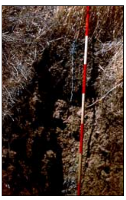
Figure 3.—Seedlings germinate in the fall and grow deep taproots during the winter. Each bandon stick is 4 inches.