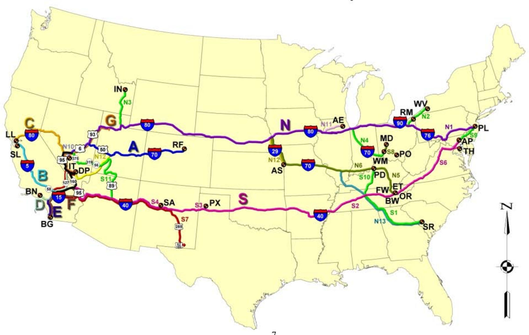
Figure 1 FY 2004 National Low-Level Waste Transportation Routes