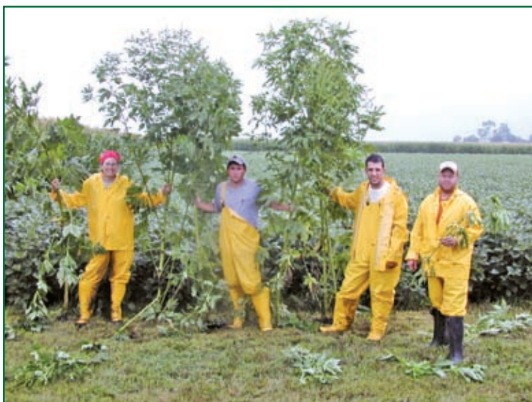
Figure 3. Giant ragweed plants can be up to 17 feet tall and are often 1 to 5 feet taller than the crops with which they are competing.

When mature, giant ragweed can reach up to 17 feet tall, but height often depends on whether giant ragweed must compete with other plants for sunlight. Giant ragweed in the field is often 1 to 5 feet taller than the crop with which it is competing (Figure 3). For example, in an Illinois study where giant ragweed emerged with corn and soybeans planted on the same day, giant ragweed reached a height of 9 feet in corn and 6 feet in soybeans.