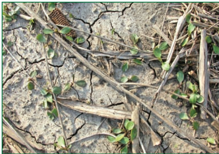
Figure 1. Giant ragweed seedlings can be identified by their fairly large, spatulate (spoon-shaped) cotyledons.

Giant ragweed seedlings initially emerge in late March in most of the North Central region. They can be identified by their spatulate (spoon-shaped) cotyledons, which are fairly large, ranging from 3/8 to 5/8 inch wide, 1 to 1 3/4 inches long, and up to 1/16 inch thick (Figure 1). Cotyledons unfold from a hairless hypocotyl and have an indentation at the base of the cotyledons. The first true leaves are entire and ovate with deep lobes.