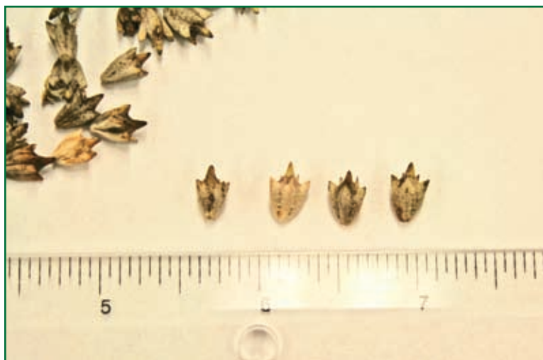
Figure 4. The points and ridges along the top of giant ragweed seeds give them a crown-shaped appearance.

A single giant ragweed plant in a soybean field can produce up to 5,100 seeds, or up to 3,500 seeds per square yard when growing in competition with corn. The seeds are encased in a woody hull (involucre) and are quite large compared to those of other Midwest weeds. The seeds vary from 3/16 to 7/16 inch long and 1/8 to 1/4 inch wide (Figure 4). They have often been described as crown-shaped, with a point at the top and a series of smaller points or ridges circled around the center point.