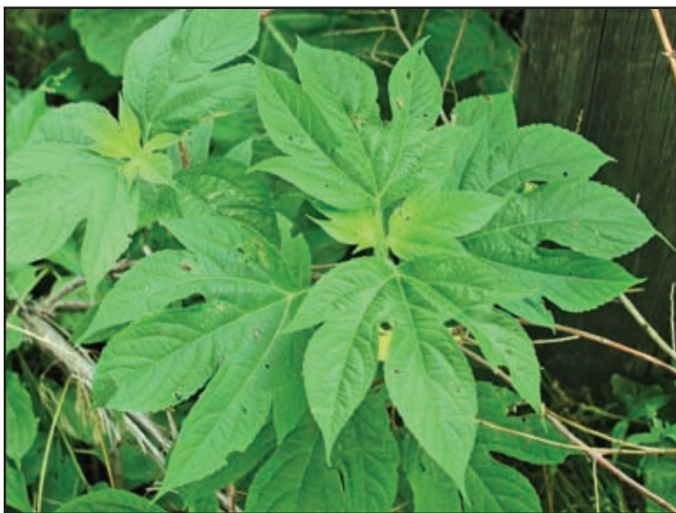
Figure 2. Giant ragweed leaves generally have 3 distinct lobes, but can have as many as 5. Leaves are typically opposite and always simple.

Leaves have stiff hairs that point toward the tip. Only after the second pair of true leaves appear do the leaves show the lobes that are a typical, familiar characteristic of giant ragweed. In most cases, leaves are opposite and always simple. Giant ragweed leaves generally have 3 distinct lobes, but can have as many as 5 (Figure 2).