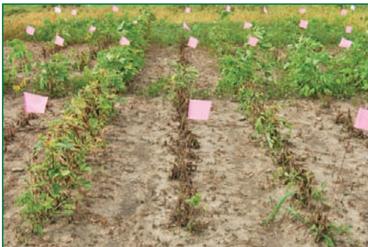
Figure 5. Three weeks after application, these giant ragweed plants have survived a POST application of glyphosate at a rate of 2.25 lbs. ae/A, suggesting a low level of glyphosate resistance.

More recently, research in Indiana and Ohio has confirmed what appears to be a low level of glyphosate resistance in several giant ragweed populations (Figure 5). Plants from these populations have survived glyphosate applications of up to 3 lbs. ae/A in field studies (Figure 6).