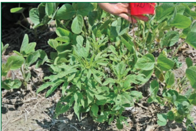
Figure 6. Giant ragweed control was inadequate in a number of fields across Ohio and Indiana even where glyphosate was applied 3 or 4 times, which may indicate a loss of sensitivity to glyphosate.