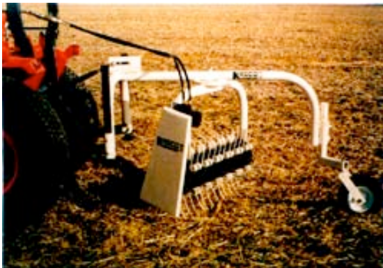
Kasco straw demulcher, www.marketfarm.com/cfms/straw_demulcher.cfm

What is a good mulch material? The traditional mulching material for strawberries in New England is straw. Straws from wheat, rice, oats, or Sudan grass work well. Straws coarser than Sudan grass are not