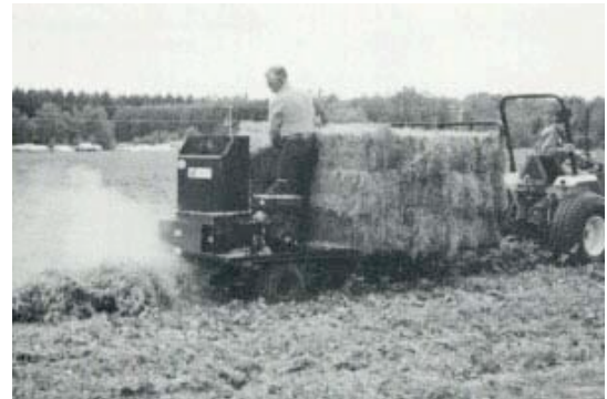
Mulchmaster™ straw mulcher, www.agromatic.net/mulch.html

How and when is the mulch removed? In the spring, when plants begin to show growth under the