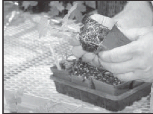
Inspection of newly rooted gooseberry cuttings.

additional hormone. Some of these species are the ground covers and shrubs. Other species will require low to medium concentrations of hormone and a few will need high concentrations for best rooting. A word of caution on hormone, "more is not always better." In the references concentrations will