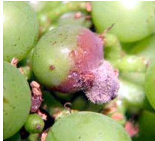
Botrytis on berry.