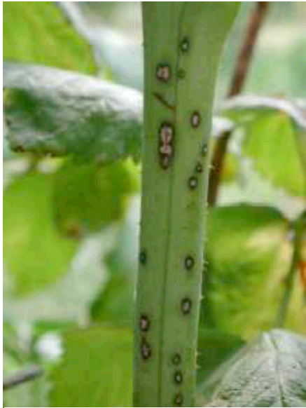
Figure 2: Anthracnose on primocanes threatens next year's crop