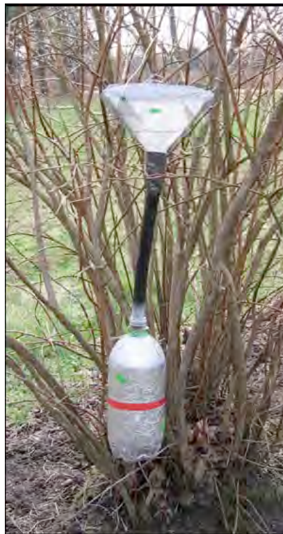
Figure 3. Michigan State University spore trap (Sporomatic 2000 Deluxe) designed to collect rain water and spores of rainsplash- dispersed fungi. The aluminum foil is to protect the sample from heating up due to sunlight.

Botrytis gray mold. Do consider the pre-harvest interval as well as fungicide resistance management and systemicity in your choice of fungicides.