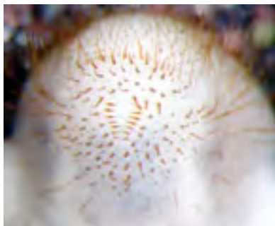
Japanese beetle grubs have hairs in a distinctive V pattern.

http://www.blueberries.msu.edu/japanesebeetle.htm