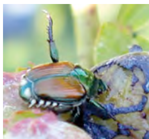
Adult beetles feed on ripe fruit and foliage.

Adult beetles are about 13 mm long with a metallic green thorax and shiny, brown wing coverings. Rows of white tufts are distinctive on the undersides of the abdomen. Male and female beetles