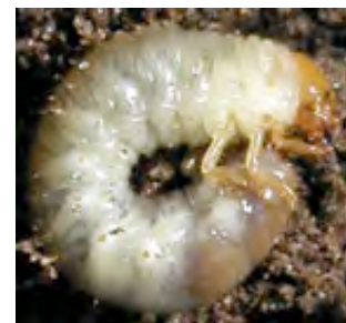
C-shaped grubs are found in soil under grassy areas

Japanese beetle grubs can be distinguished from similar grubs by two rows of seven hairs in a V shape on the inside of the posterior segment. Beetles are best detected on blueberry bushes during calm, hot, cloudless afternoons. Traps for monitoring Japanese beetle are highly attractive but can increase the number of beetles flying into an area. In small plantings, beetles can be removed from bushes.