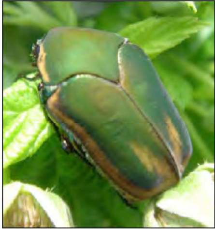
Green June beetle

In 1972, a USDA entomologist published an excellent monograph on the Japanese beetle. In this manual, he proposed a rule of thumb