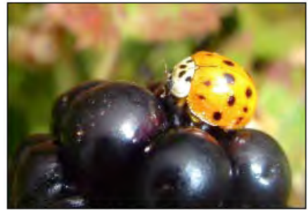
Multicolored Asian lady beetle

Scorpionflies have been seen visiting the brambles at Kentland, occasionally on berries. Their net role is uncertain; these insects (not really flies, despite the name) have a mixed diet, feeding on other insects, as well as fruit material and decaying animal matter. The insect shown is a male, indicated by the tail resembling the sting of a scorpion. These are