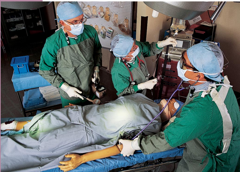
Physicians, nurses, paramedics, and physicists receive training in the treatment of radiation exposure.

REAC/TS' radiation experts are on call 24 hours a day for consultations or to give direct medical and radiological advice to people at the REAC/TS facility or accident site. If needed, additional REAC/TS physicians and other team members can be deployed to the accident scene. This highly trained and qualified team is pre-