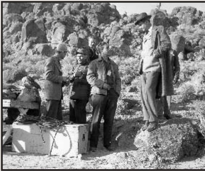
Journalists set up on News Nob to witness an atmospheric test in March 1953.

News Nob had a simple beginning. It received its name when a former Nevada Test Site construction worker who took a weather beaten board with a yellow door knob attached to it from an old outdoor lavatory and painted "This is News Nob" across the door in yellow. The original board is gone, but a replacement board still manages to hang onto to the side of the rock pile, despite years of wind and rain that tried to pry it loose from its precarious perch.