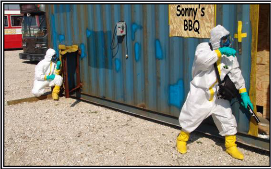
Responders check the buildings surrounding the scene of a simulated RDD attack on a metropolitan bus station.