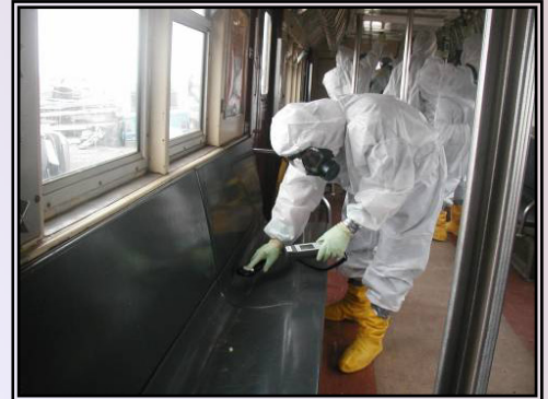
After rescuing victims of an RDD attack, responders detect radioactive contamination in a subway car.

The Weapons of Mass Destruction Radiological/Nuclear Awareness Course (AWR-140-W) is available online at http://respond.emrtc.nmt.edu/campus/index.k2