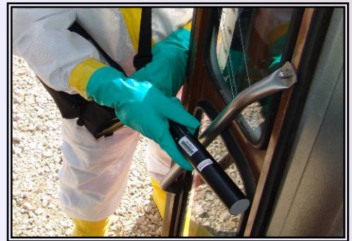
A responder checks for safe radiation levels in a bus after a simulated RDD attack on a metropolitan bus station.