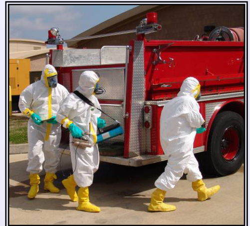
Responder team prepares to assess the scene after a simulated terrorist attack involving radioactive medical devices in a hospital.