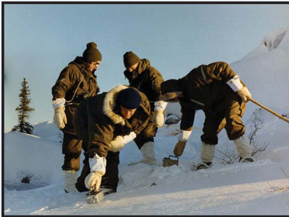
Team members, dressed in specially designed arctic clothing, begin the painstaking process of searching the area with hand-held radiation detectors.

to the point of impact from locations in Las Vegas, Nevada; Fairfield, California; Washington, D.C., and Albuquerque, New Mexico.