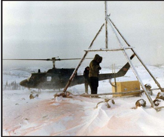
A microwave ranging transponder unit is placed under a landmark. The distance limitations of the units meant constant movement was necessary as the search moved along the footprint.