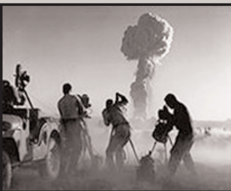
Intrepid photographers ventured as close as four miles to the nuclear blasts.