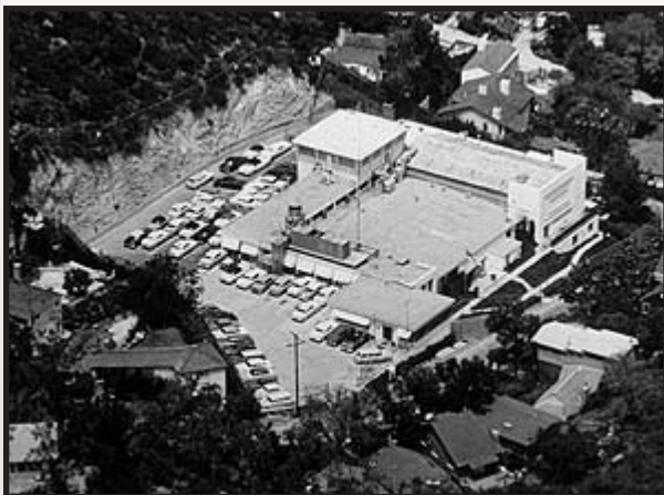
The Lookout Mountain facility was a fully self-contained 100,000-square-foot studio overlooking the famous Sunset Strip.