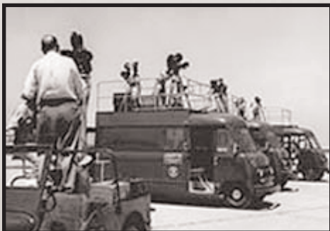
Film crews and photographers prepare to film a nuclear test at the Nevada Test Site.