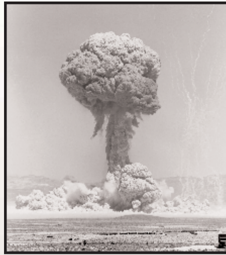
The MET test, photographed by Lookout Mountain photographers on April 15, 1955 at the Nevada Test Site.

The Air Force's 1352nd Photographic Group was based at Lookout Mountain Air Force Station in Hollywood, but photographers were stationed at Mercury - base camp for the Nevada Test Site (NTS), to capture the images produced by nuclear testing.