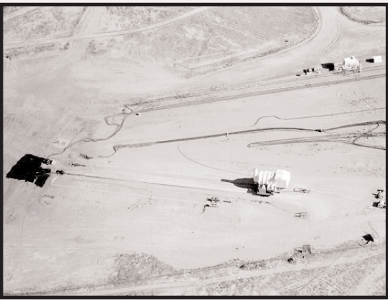
An aerial view of the Huron King test chamber (right) moments before the test in 1980.