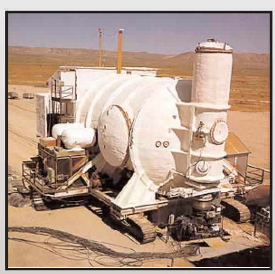
The Huron King test chamber is still located in Area 3 of the Nevada Test Site.

For more information, contact: U.S. Department of Energy National Nuclear Security Administration Nevada Site Office Office of Public Affairs P.O. Box 98518 Las Vegas, NV 89193-8518 phone: 702-295-3521