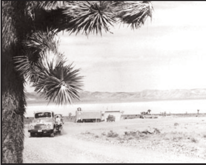
The Sandia crew sets up equipment to begin fuze testing at Yucca Lake on the Nevada Test Site.

A test base was established in the summer of 1946 on the shores of Salton Sea, California where Sandia Laboratory could conduct ballistic tests and monitor the operation of fuzing and firing systems. This area, then known as Sandy Beach, had been utilized by the Manhattan Project for ballistic and fuzing and firing testing of the first atomic weapons.