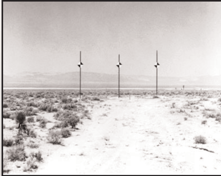
Bomb targets stand in Yucca Lake awaiting impact.

For two years, as the Salton Sea crew traveled back and forth to Yucca Flat as needed, several problems with Sandia's use of Yucca Flat as a test range became apparent. Sandia's testing came second to the use of Nevada Test Site for atmospheric and underground nuclear testing. While Yucca Flat was adequate for high-altitude drops, mountains on three sides obstructed aircraft approaches for low-altitude drop tests. Sandia also needed a hard concrete target to test low-altitude bomb drops onto enemy aircraft runways and concrete structures, and there was no such structure at Yucca Lake.