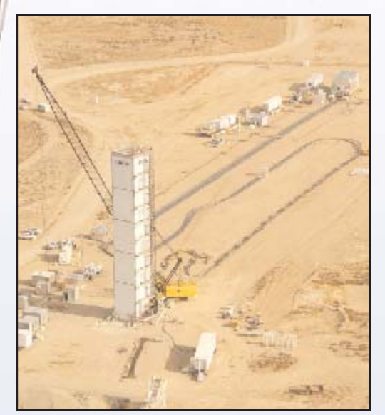
An aerial view of the emplacement tower, diagnostic cables and diagnostic trailers used during an underground nuclear test.

Between 1951 and 1992, 828 underground nuclear tests were conducted in specially drilled shafts, horizontal tunnels, and craters at the Nevada Test Site. Most vertical shaft tests assisted in the