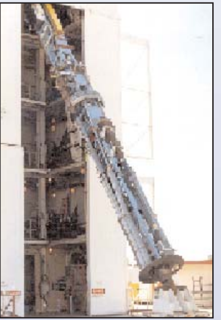
The diagnostic canister moves into the emplacement tower for underground placement.

development of new weapon systems. Horizontal tunnel tests occurred to evaluate the effects (radiation, ground shock) of various weapons on military hardware and systems.