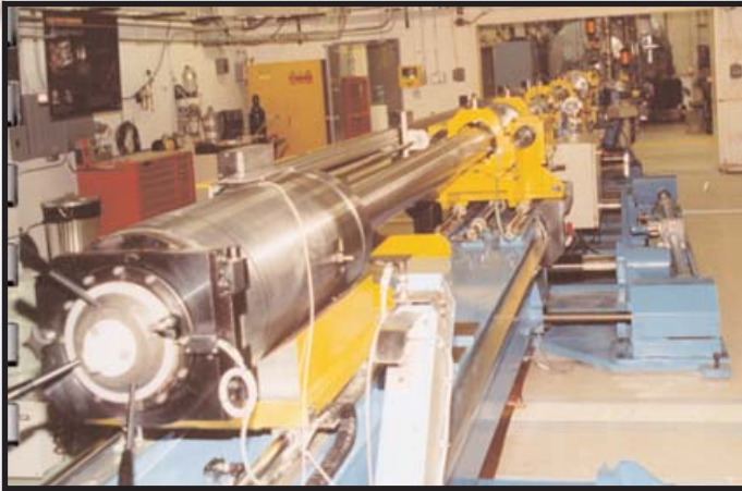
The JASPER two-stage gas gun.