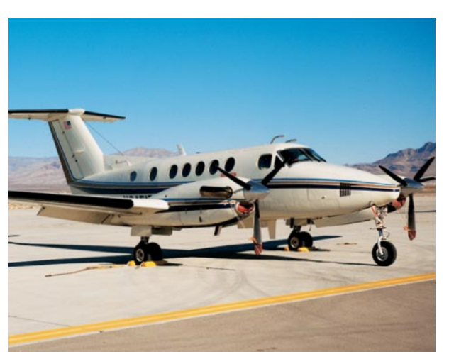
Fixed-wing aircraft provide ground surveys.

qualitative data to get a closer assessment.