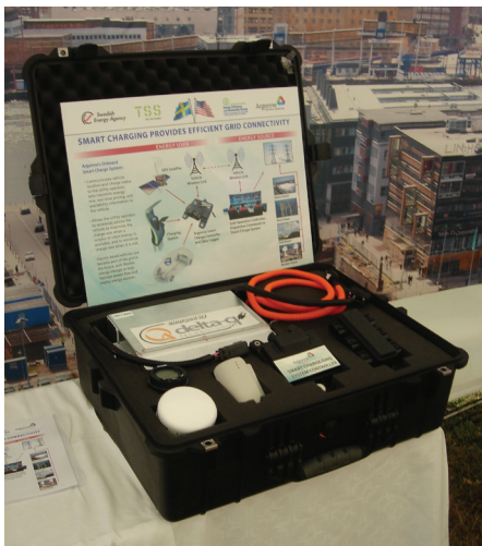
The Argonne Smart Charge System