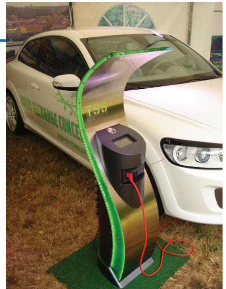
The Test Site Sweden interactive charger concept and the Volvo ReCharge PHEV concept vehicle.

The off-board charging stations will inform the user, provide an opportunity for user input to the recharge process, and manage the billing automatically.