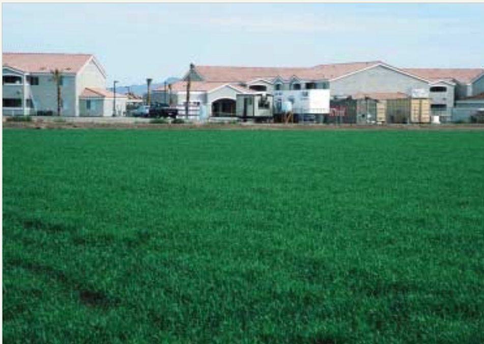
Contrast of a wheat field and new subdivisions in Yuma, AZ.

Removing the development rights from land generally reduces its value. The value assigned to a conservation easement amounts to the difference between the land use prescribed by the restriction placed on it by the easement, and the value of the land if used for a higher-value purpose, such as development. The value is usually determined by a professional appraiser who determines the difference between fair market value of the property, using comparable sales in the area, and the land's value under the restrictions of