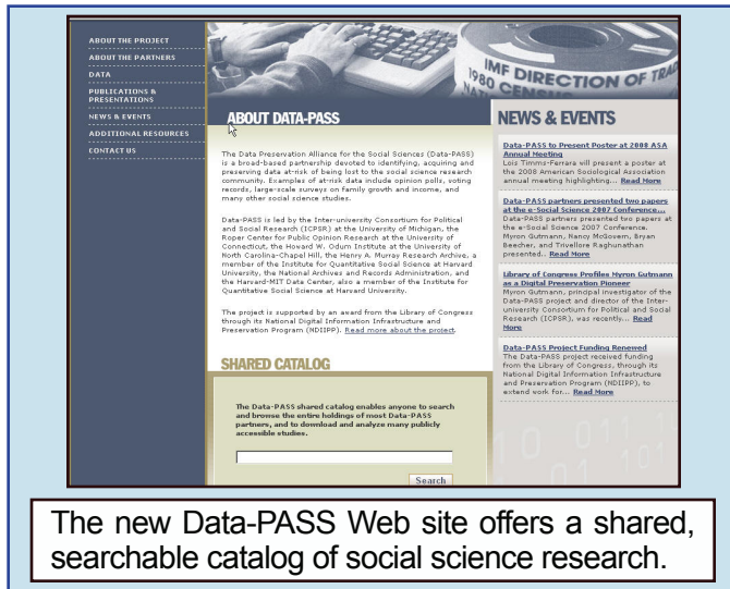
The new Data-PASS Web site offers a shared, searchable catalog of social science research.

The Data Preservation Alliance for the Social Sciences (Data-PASS), one of the first projects funded by NDIIPP, recently released a new version of its Web site, www.icpsr.umich.edu/DATAPASS .